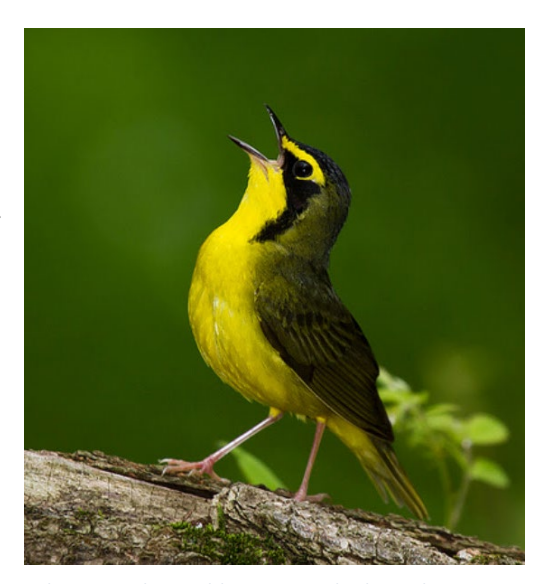
The Kentucky warbler requires high-quality wet woods with a robust natural understory. Sprawl development and associated forest fragmentation and deer browsing have led to a 70% decline in this species in Maryland over the past 49 years.